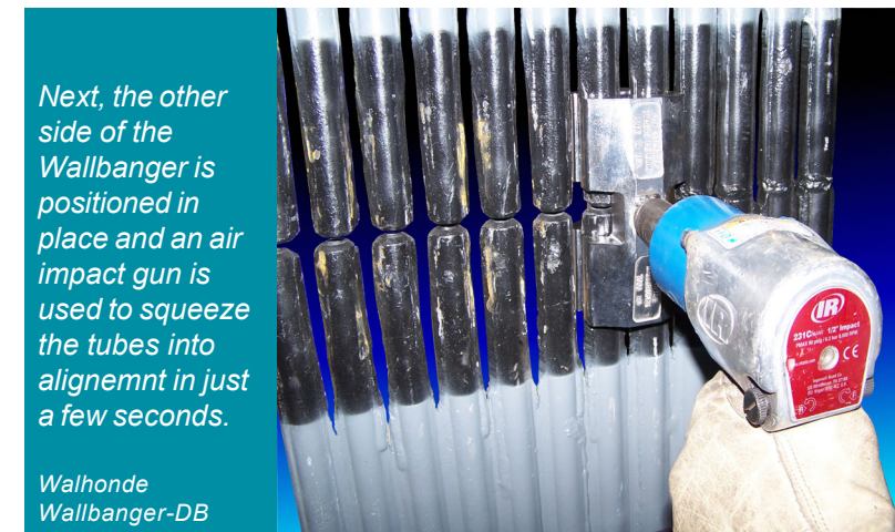
Next, the other side of the Wallbanger is positioned in place and an air impact gun is used to squeeze the tubes into alignment in just a few seconds.

technology permits the welder to achieve the perfect alignment and gap, the first time, everytime. Little skill is needed and most welders/fitters adjust to the tool very quickly. The welders, generally one on each side of the wall/tube to be welded simply holds the precision designed clamps against the loose ends of the tube(s) to be welded. Next, the worker places the specialty bolt in the threaded hole; applies the impact wrench to the bolt and in less than one minute - a perfectly aligned tube is ready to be tacked. The Walhonde Wallbanger tool is removed and the welder completes the root pass weld.